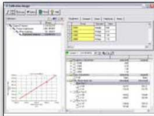
Use the built-in manual calibration or leverage the available Darwin Calibrator module