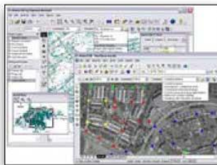
Stand-alone, MicroStation, and AutoCAD platforms for total freedom and versatility

WaterCAD Scenario Management Center gives engineers full control to configure, run, evaluate, visualize, and compare an unlimited number of whatif scenarios within a single file. Engineers can easily make decisions by comparing unlimited scenarios, analyzing rehabilitation alternatives for multiple planning horizons, evaluating pump operation strategies, or flushing alternatives for emergency contamination events.