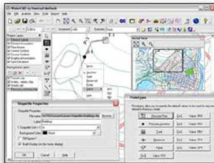
Layout your WaterCAD model from scratch with extreme freedom and ease